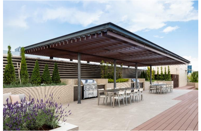
Barbecue kitchens with large grills